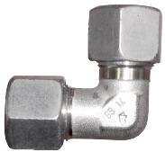
ANCCOM: Stainless steel wick diffuser adjustable union elbow

AISI 316 stainless steel fitting according to DIN 2353 heavy series, tube-tube-tube.