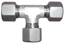
AN/CTM: T stainless union for wick adapter.

AISI 316 stainless steel fitting according to DIN 2353 heavy series, tube-tube-tube.